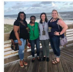
AL Assoc. of Forensic Science conference at Gulf Shores

Calling Chemistry and Biology majors to apply for the Master of Science in Forensic Science (MSFS) at UAB.