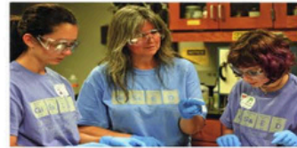
Girls in Science & Engineering Day

Find more information at www.uab.edu/forensicscience