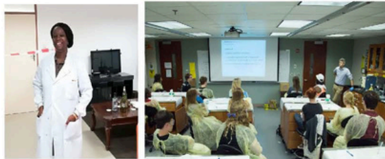
Forensic Science faculty in a mock crime scene and the lab.