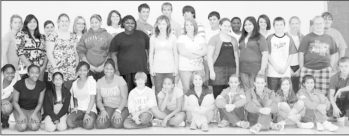
FBLA members — Members of the 2008-09 Rivercrest Junior High School Future Business Leaders of America are pictured. The 42-member club is currently conducting a fundraiser with 50 percent of the proceeds benefiting St. Jude Children's Research Hospital. The FBLA is selling red school mascot T-shirts and anyone interested may contact a member or the school at (870) 655-8421.